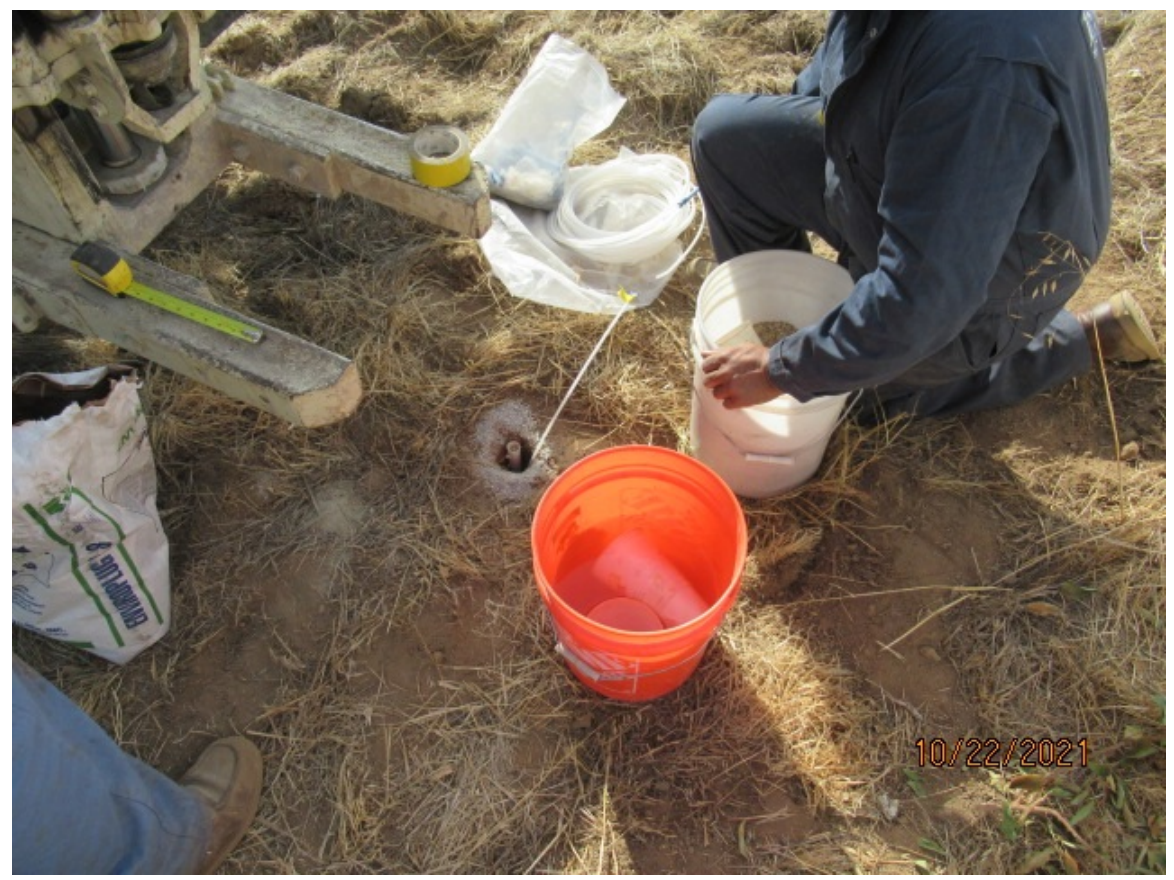
Photo 2 - Soil vapor probe construction at location SVP-5 is shown. The deeper 10-foot soil vapor probe is already installed with the 5-foot probe due to be installed utilizing the plastic pipe shown in the borehole next to the 10-foot soil vapor probe tubing. Construction materials include sand, bentonite granules, water, plastic tubing, and plastic probe tip inserts.