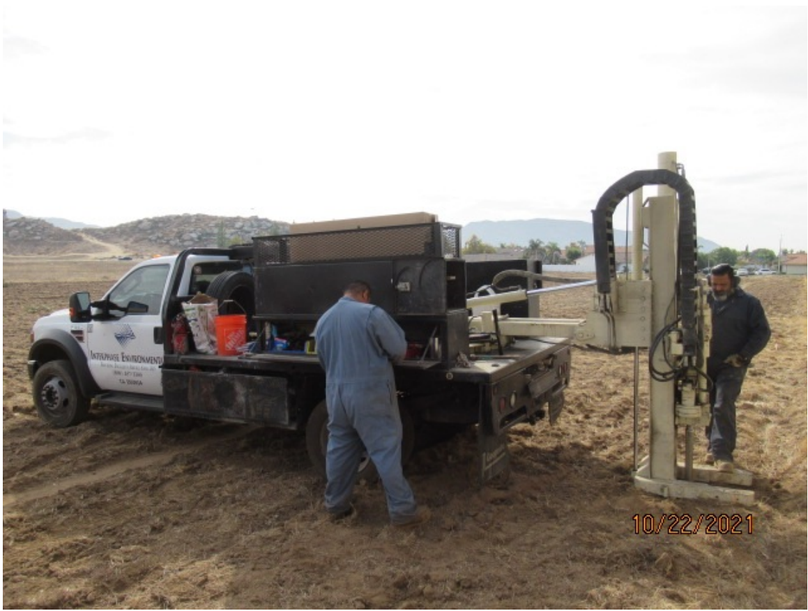
Photo 1 - The Interphase Environmental, Inc. direct-push rig is shown advancing the soil borehole at soil vapor probe location SVP-3 along the west side of the subject site, coincident with the offsite church building (location of former newspaper operation building) to the west.