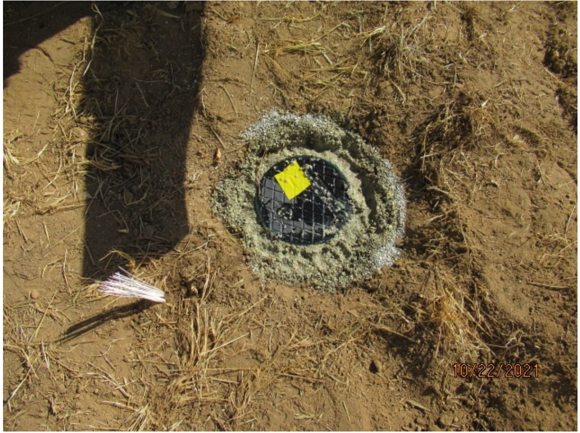
Photo 3 - View of the soil vapor probe location SVP-3 following soil vapor probe construction. The probe tubing at the surface is buried in a plastic bag beneath the black sprinkler valve cover which is surrounded by hydrated bentonite granules with a survey hub nearby to mark the location. These cover and marking procedures were implemented to help protect the soil vapor probes prior to soil vapor sample collection and analysis.