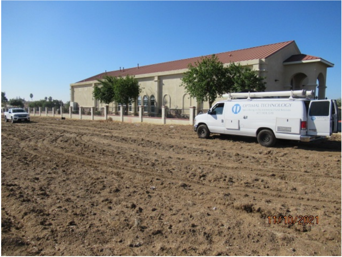
Photo 5 - Southwesterly view, looking towards the location at SVP-5. To the right is the Optimal Technology van, which includes a mobile laboratory. The soil vapor sample collection and analysis was performed by Optimal Technology personnel. The white truck to the left is coincident with and just east (left) of the location at SVP-3.