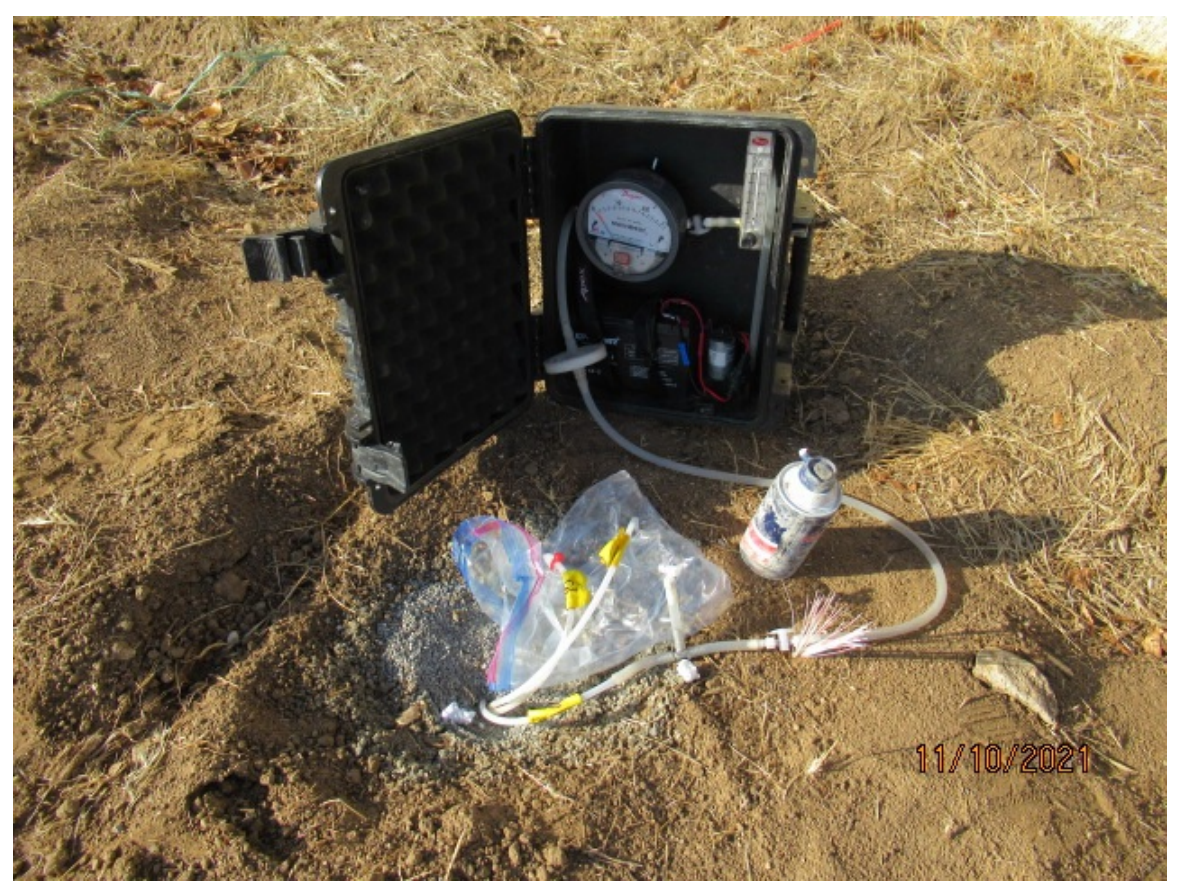
Photo 4 - An Optimal Technology mobile vacuum pump setup is shown connected to the 5-foot soil vapor probe at SVP-1 during purging, prior to sample collection and analysis. The shaving cream contains isobutane, a tracer compound for leak detection.

Photo 3 - View of the soil vapor probe location SVP-3 following soil vapor probe construction. The probe tubing at the surface is buried in a plastic bag beneath the black sprinkler valve cover which is surrounded by hydrated bentonite granules with a survey hub nearby to mark the location. These cover and marking procedures were implemented to help protect the soil vapor probes prior to soil vapor sample collection and analysis.