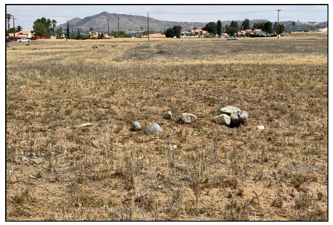
PHOTOGRAPH 1 Typical Ground Visibility, Looking North