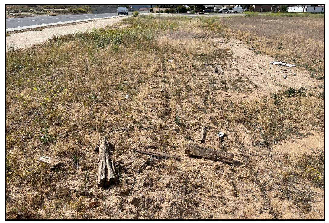
PHOTOGRAPH 2 Sample of Construction Debris Along the Southern Edge, Looking South