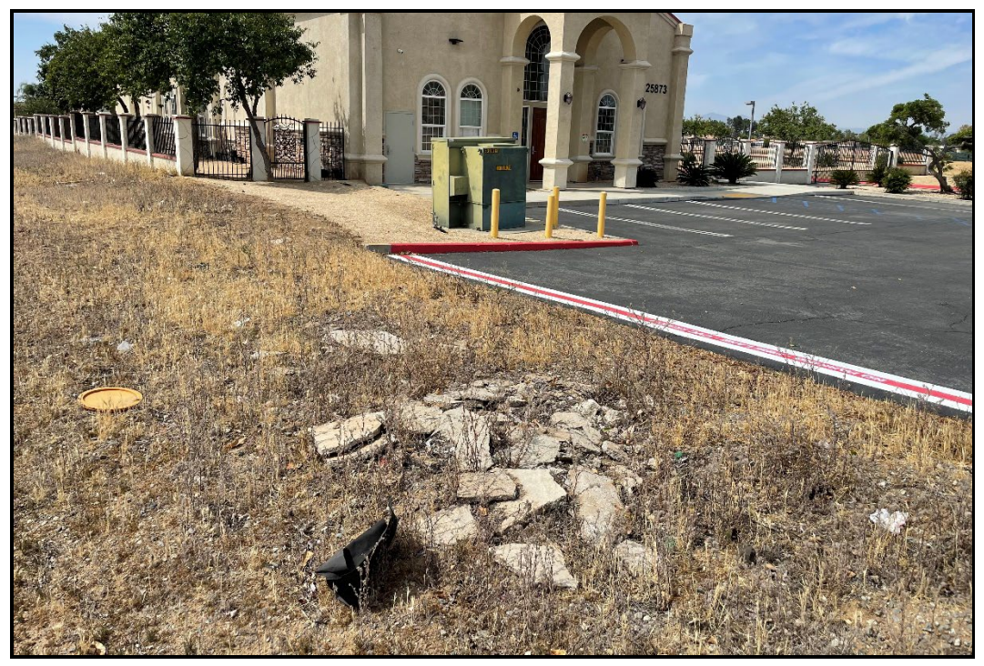
PHOTOGRAPH 3 Concrete Pile Along the Western Edge, Looking Southwest