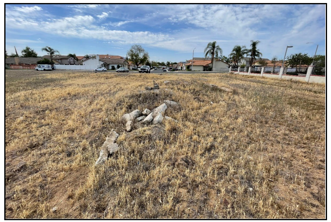
PHOTOGRAPH 4 Push Pile of Concrete and Rock, Looking South