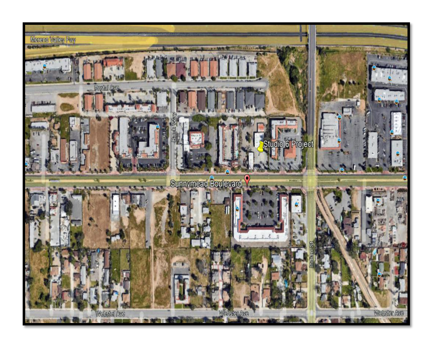
FIGURE 1 PROJECT SITE AS SHOWN ON GOOGLE EARTH