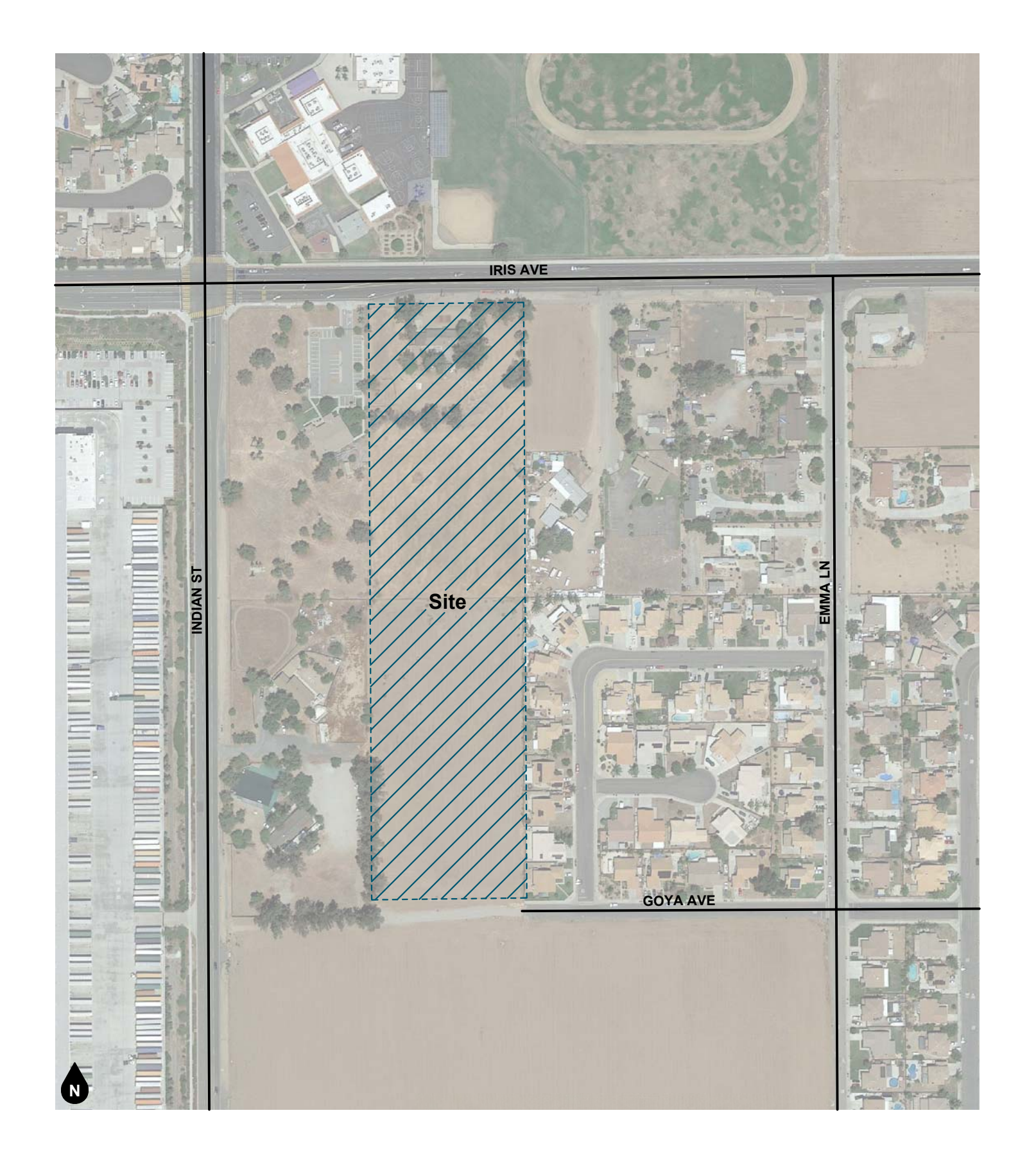
Figure 1 Project Location Map