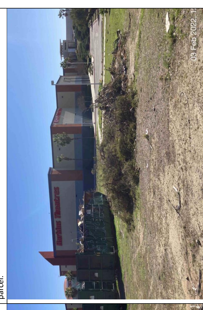
Photo 4. Viewing SE. Note theatre, paved parking and roads; dumpsters and debris pile onsite.