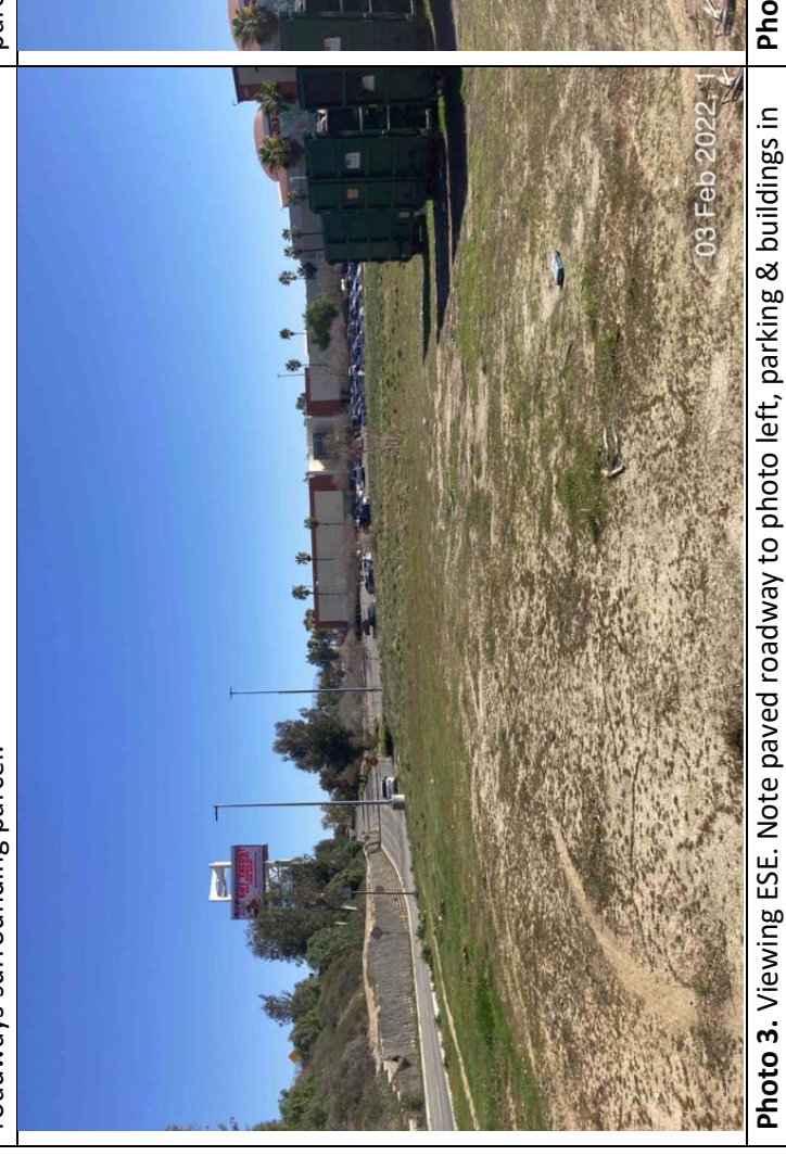
Fnoto 5. Viewing ESE. Note paved roadway to prioto left, parking & buildings in background and photo right; large dumpsters onsite.